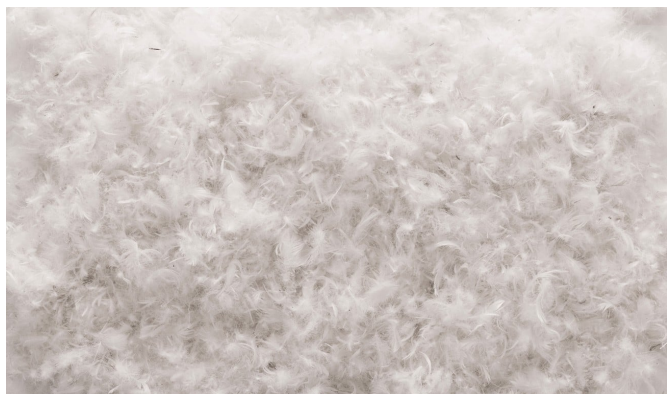
Pillow in goose eiderdown

Padding in 80% goose eiderdown and 20% white goose feathers. Thanks to the high ventilation temperature will remain static throughout the night. It absorbs humidity and lets exceeding heat evaporate. 100% cotton pillow case, removable and washable.