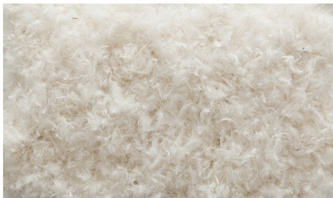
Pillow in goose feathers

Padding in goose feathers 100%. Thanks to the high ventilation temperature will remain static throughout the night. It absorbs humidity and lets exceeding heat evaporate. 100% cotton pillow case, removable and washable.