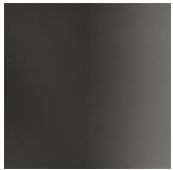
GLOSSY PAINTEDBRO WN NICKEL

FINISHINGS\STRUCTURE\GLOSSY PAINTEDBROWN NICKEL (1)