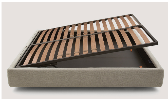
Container box with tip-up bedstead

Bedstead with metal frame, movement assisted by shock absorbers. Flexible slats in beech wood joint assembled in the frame. Dimensions in: w 39 1/4"-55"-63"-70 3/4" 78 3/4" x d 78 3/4"-82 3/4". Queen size w 60" x d 80". King size w 76" x d 80".