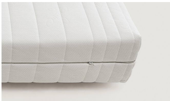
Amicor Pure™ cover

Removable cover in antimicrobial fabric Amicor Pure™, a fibre that, thanks to a slow spreading mechanism supplies a barely adequate quantity of a safe additive for both the skin and the environment. This substance eliminates allergens and microbes, which are usually in mattresses. The antimicrobial effect is not eliminated by washing the cover.