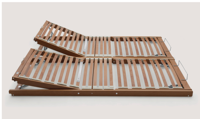
Anatomic bedstead with manual movement

Bedstead in beech wood with flexible slats fixed on pair on rubber supports. In the pelvis area, the slats are doubled to grant the best support and are provided of sliders to adjust the flexibility. Manual headboard movement. We suggest the use of single standard mattresses or latex mattresses. Dimensions in: w 31 1/2"- 35 1/2"-39 1/4" d 78 3/4"-82 3/4" h 2 3/4".