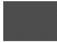
leather Spring 5310 ardesia outer cat. p