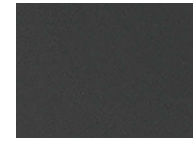
mat brown nickel base