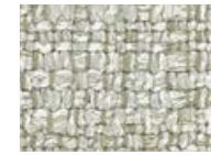
Sparta 20 crema inner cat. d