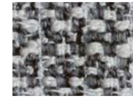
Micene 02 acciaio inner * cat. d