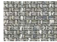
Lipsi 03 cenere inner * cat. d

Armchair with pouf available in two versions with non-removable cover. Outer cover in leather Spring 5310 ardesia and inner cover in fabric Lipsi 03 cenere. Outer cover in fabric Naxos 21 roccia and inner cover in fabric Micene 02 acciaio. Armchair only is also available in outer cover in leather Spring 5504 tortora and inner cover in fabric Sparta 20 crema. Swivel base of armchair and fixed base of pouf are in mat brown nickel.