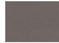
leather Spring 5504 tortora * outer cat. p