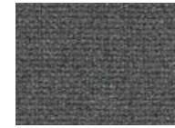
Naxos 21 roccia outer * cat. e